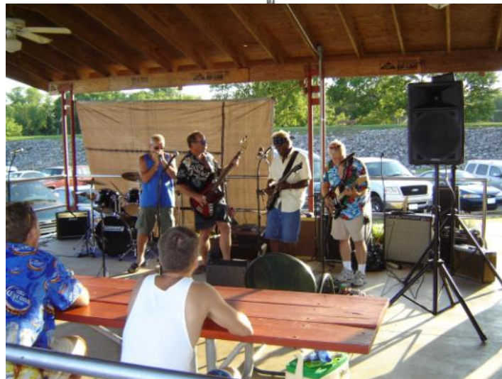
The "jam session" during the TYC/CYC party was a blast!!!