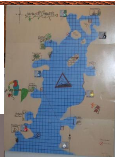
New Sailing Grounds for the Murder Mystery game

Disclaimer... Views expressed herein are not necessarily those of TYC or individuals other than the rogue writer of this article.